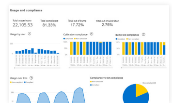
Blackline Analytics reporting platform